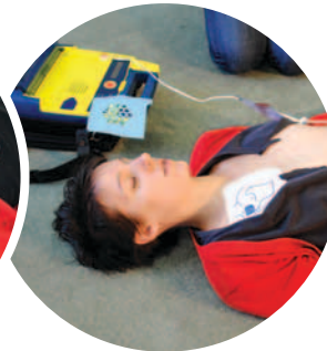
Early Defibrillation – to re-start heart