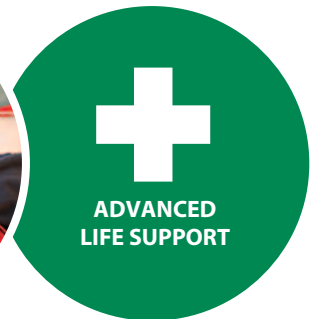
Early Advanced Care – to stabilise casualty