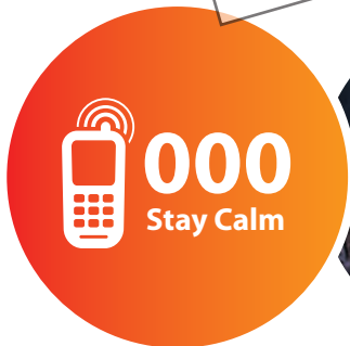
Early Access – to get help